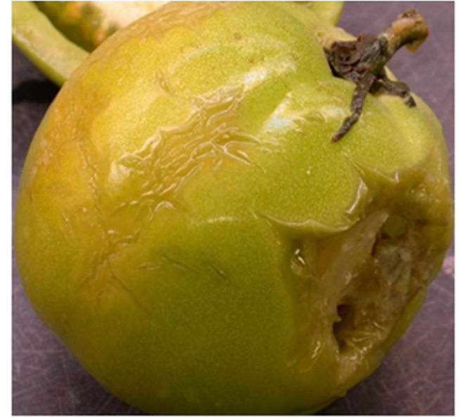
Figure 3. Watery-rot phase of sour rot on water-congested green fruit.

The sour-rot pathogen, Geotrichum candidum , is a type of yeast. Its growth on lesions on fruit resembles a thick, gelatinous mass similar in appearance to cottage cheese. The lesions themselves may initially be watery (Figure 3) but later become coated with pathogen growth (Figure 4) and remain relatively firm unless a secondary infection by a soft rot bacterium occurs. However, the odor of these lesions is similar to that produced by lactic acid bacteria, hence the disease name, sour rot.