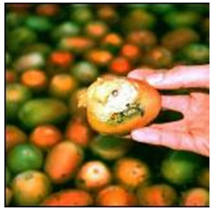
Figure 13. An infected tomato can spread inoculum to healthy tomatoes in the flume/dump tank.

may internalize in wounds or stem scars on tomatoes where they are protected from antimicrobial treatments. "Vigilance" is the key word in preventing decay. In the following section, key considerations are presented for establishing good management practices (GMPs) to maintain sanitary conditions during tomato packing and handling.