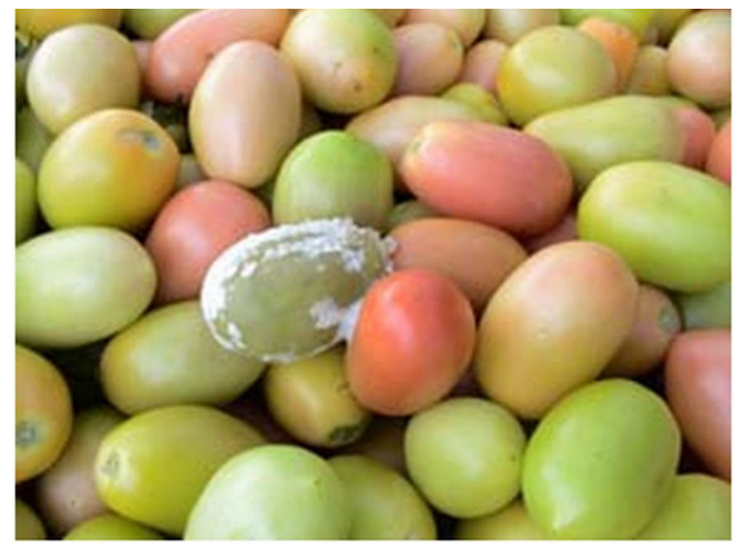
Figure 8. Water mold covering infected fruit (snowball) and spreading to adjacent fruit.