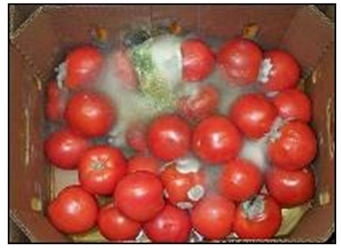
Figure 6. A carton of tomatoes with "nested" Rhizopus rot (and secondary fungi).

Phytophthora , or buckeye rot , usually causes a circular rot that looks water-soaked, later darkening in the center and/ or becoming overgrown with sparse, white mycelia (Figure 7). The pathogen belongs to a group of microorganisms often referred to as "water molds," because their infectious propagules are dispersed by water. Therefore, buckeye rot often develops on fruit growing near wet spots in a field. Initial symptoms appear as small stains in the fruit surface. On harvested fruit these stains may be overlooked by sorters. However, in stored tomatoes the small stains enlarge and the pathogen can move from diseased to adjacent healthy fruit, leading to the term "buckeye nesting" or "snowballs" (Figure 8). Buckeye rot is rare during normal production seasons, but is not uncommon during wet periods, particularly if standing water exists in fields.