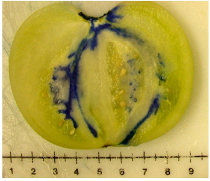
Figure 14. An extreme infiltration of the stem scar and blossom-end scar by a dye solution illustrates that microbes could be internalized under certain conditions.

presence of air bubbles in openings in the tomato surface, particularly the stem scar. For example, infiltration occurs when warm tomatoes are submerged in cool water as briefly as 5–10 minutes. As the fruit cools, air inside its tissues contracts, creating a vacuum that draws the surrounding water (and suspended microbes) into openings such as the stem scar or catface at the blossom end (Figure 14). Infiltration can also occur when fruit are struck by a high-pressure stream of water such as when tomatoes are flumed from a gondola or if there is an excessive amount of fruit in a dump tank or flume that causes some fruit to be submerged several layers deep.