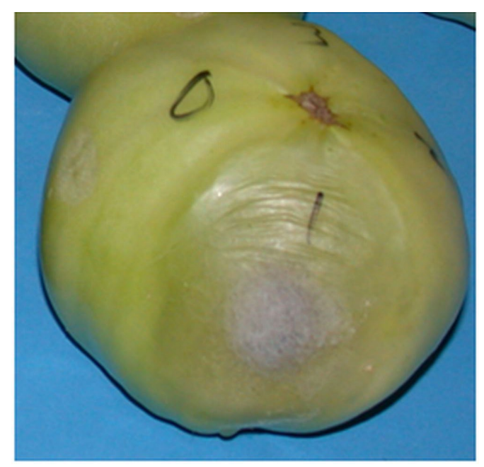
Figure 5. Rhizopus rot on green fruit.

structures (especially under humid conditions). Tissues within the lesion are usually held together by relatively coarse strands of fungal hyphae. Dark sporulation may crown the white tuft of Rhizopus . The mycelium can infect adjacent fruit through natural openings or mechanical wounds creating nests of mold and diseased fruit (Figure 6). The spores are extremely small and lightweight, and can be carried by air currents to infest new fruit, potentially far from the source. Under favorable conditions, Rhizopus has been observed to grow short distances on dry surfaces, such as pallets and cartons and it may survive for months in fruit residues left in picking containers and field bins.