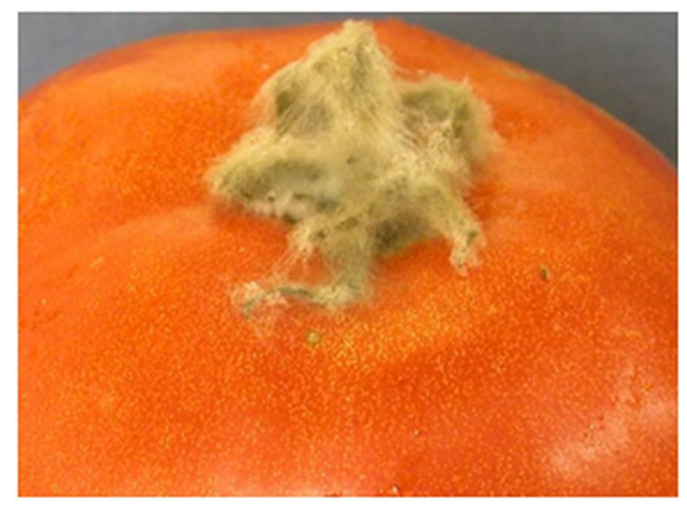
Figure 12. Storage mold covering an attached stem but without evidence of penetration into the fruit.

Storage molds can develop on fruit that have been gassed or stored for prolonged periods of time in humidified rooms. These molds grow over the stem scar, attached stem, blossom scar or other corky areas (Figure 12). They are generally non-pathogenic and do not penetrate into the flesh of the fruit. However, the mold detracts from the appearance of the fruit and may lead to shipment rejection.