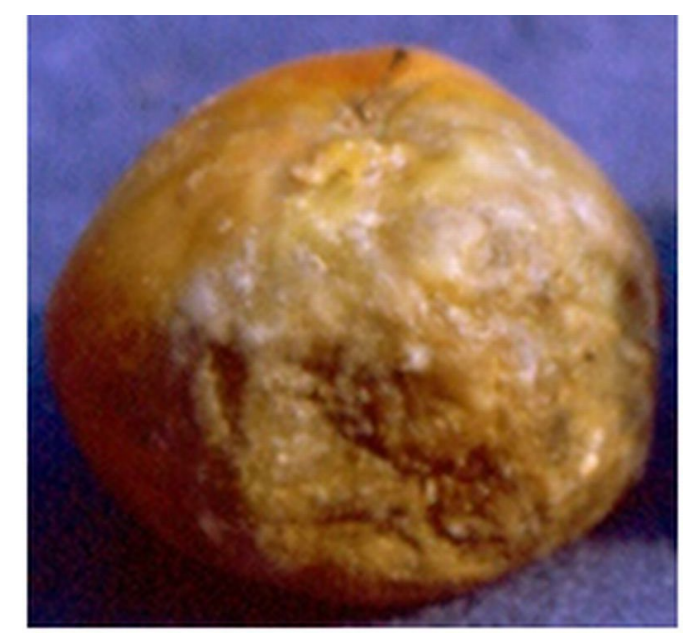
Figure 7. Advanced buckeye rot.

Phytophthora , or buckeye rot , usually causes a circular rot that looks water-soaked, later darkening in the center and/ or becoming overgrown with sparse, white mycelia (Figure 7). The pathogen belongs to a group of microorganisms often referred to as "water molds," because their infectious propagules are dispersed by water. Therefore, buckeye rot often develops on fruit growing near wet spots in a field. Initial symptoms appear as small stains in the fruit surface. On harvested fruit these stains may be overlooked by sorters. However, in stored tomatoes the small stains enlarge and the pathogen can move from diseased to adjacent healthy fruit, leading to the term "buckeye nesting" or "snowballs" (Figure 8). Buckeye rot is rare during normal production seasons, but is not uncommon during wet periods, particularly if standing water exists in fields.