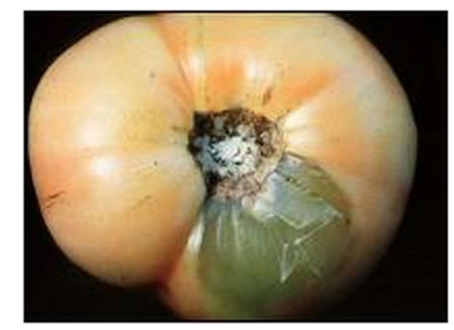
Figure 1. A typical bacteria soft rot lesion.

Certain bacteria, called the soft rot bacteria, cause a common, and potentially devastating, postharvest disease called <u>bacterial soft rot</u>. The pathogen liquefies fruit tissue by breaking down the pectate "glue" that holds plant cells together (Figure 1). Bacterial soft rot can be caused by at least four different bacteria.