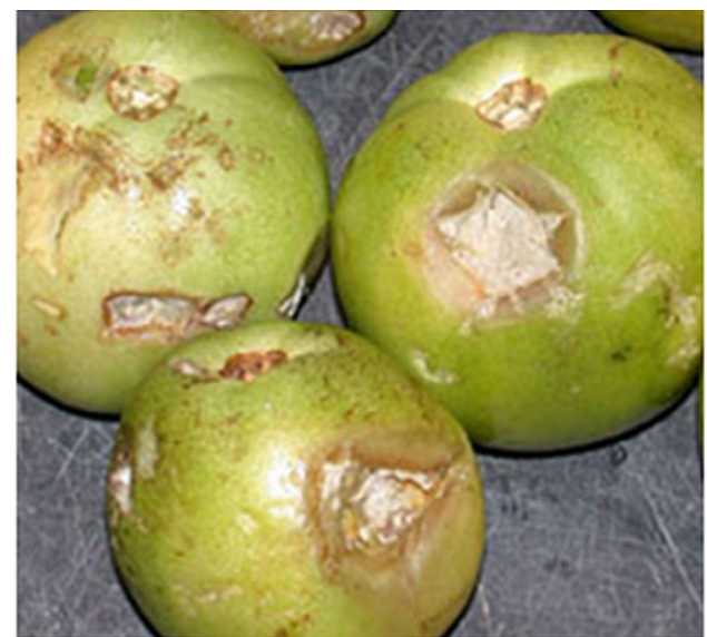
Figure 4. Sour rot lesions covered with pathogen growth.

A second common fungal pathogen is Rhizopus stolonifer , which is in the bread mold group of fungi. This pathogen grows very aggressively . On tomatoes, <u> Rhizopus rot </u> appears water-soaked and may exude a clear liquid (Figure 5). The lesion surface may be covered with thin, cotton-like fungal