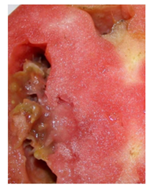
Figure 11. Dry locular cavity due to severe internal bruise.

Several other fungi can infect tomato fruit in the field and later lead to postharvest decays. However, these, like black mold rot, rarely spread among fruit within a box and can be considered minor decay problems for Florida tomatoes. However, each of these diseases can provide entry points for more aggressive decays such as bacterial soft rot, Rhizopus rot or sour rot. Fusarium rots can develop on tomatoes that are in contact with the soil and/or have been chilled in the field. The surface of the lesions is covered with fluffy white mycelium with undertones ranging from shades of pink of orange to purple. <u>Target spot</u> (Corynespora cassiicola) develops on tomatoes (plants and fruit) during long periods of high moisture and warm ambient temperatures. Fruit lesions are small, dark brown spots that enlarge and split open as the fruit ripens. If the disease becomes severe in the field, the plants will defoliate, thereby exposing the fruit to sunlight, which increases surface cracking and sun damage. Phoma rot (Phoma destructiva) begins at the blossom end of fruit as sunken black spots with water-soaked edges and dark-centered rings, similar in appearance to buckeye rot. Anthracnose, caused by Colletotricum spp. develops on primarily ripe to overripe fruit, usually during wet, warm conditions. Cladosporium rot, caused by Fulvia fulva, develops under highly humid conditions, usually in greenhouses.