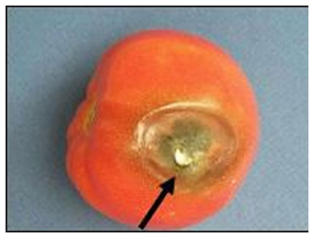
Figure 9. A fruit with a fingernail wound (arrow) that later developed into black mold rot.

Black mold rot often appears on the shoulders, by the stem scar, or on the blossom end of fruit that have been injured by chilling, calcium deficiency, sun exposure, climatic factors that cause fruit cracking (e.g., high temperatures and high rainfall), pesticide phytotoxicity or imperfectly closed blossom-end pores (catfacing), and, perhaps, harvests during cold weather. Several different pathogens may cause black mold rots including Alternaria arborescens, Stemphyllium botryosum, or S. consortiale. Lesions are initially sunken or flattened areas associated with a crack or other injury that quickly become covered with a dark brown to black mold (Figure 9). Internal lesions may develop from an infected stylar pore or vascular strand connected to the stem scar (Figure 10). In particular, dry locular cavities that have lost their gel due to a severe internal bruise (Figure 11) are likely to develop internal blackspot. This disease usually does not spread from fruit to fruit in boxes. Green fruit are quite resistant unless exposed to chilling temperatures, blossom-end rot or damage by certain spray mixtures.