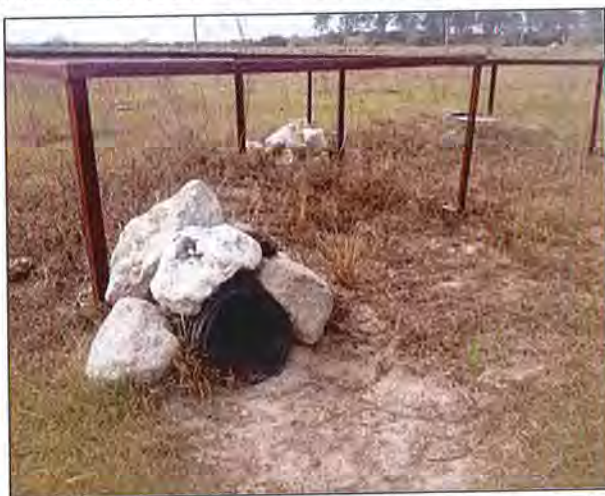
Figure D-1. Metal device used to prevent collapse of artificial burrows while allowing full access for cattle to graze.

In rural areas, one successful example is a design used for western burrowing owls (Johnson et al. 2010) and modified for use in Florida (Quest Ecology, Inc., unpublished data). The design uses half of a 55-gallon food