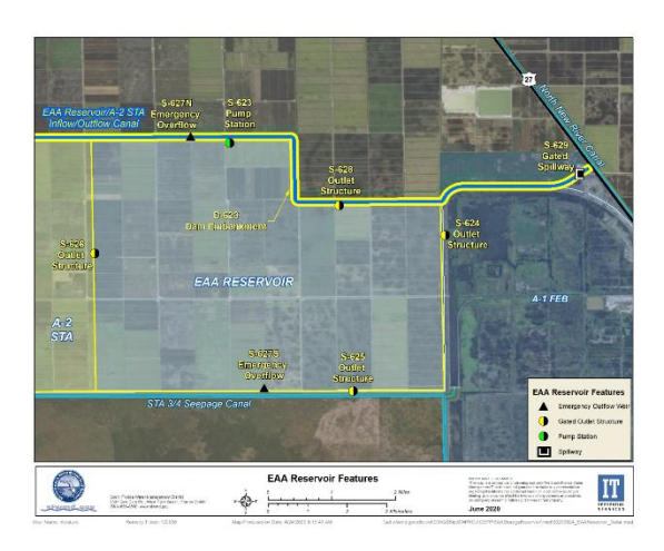
Figure 3-6. Key Features of the EAA Reservoir.