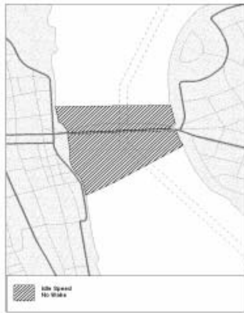
Drawing C – Bridge of Lions