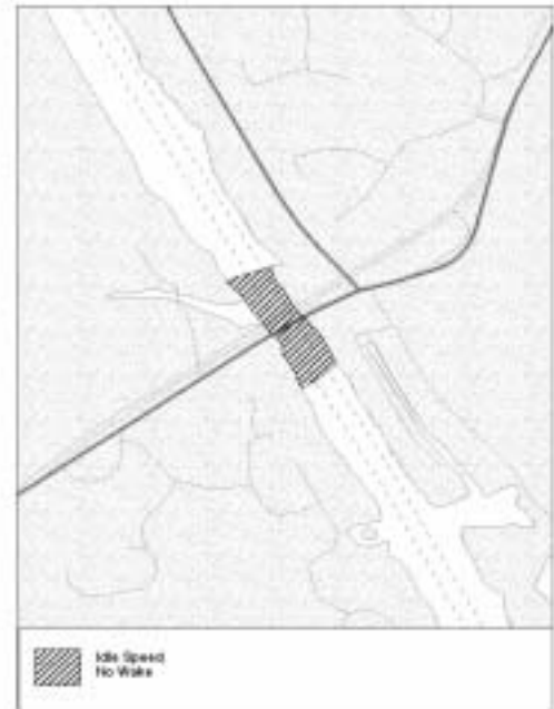
Drawing A – Palm Valley Bridge S.R. 210

(2) The boating restricted areas are depicted on the following drawings: