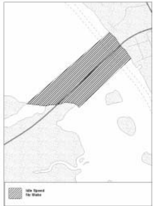
Drawing E – Crescent Beach Bridge