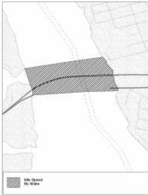
Drawing B – Vilano Beach Bridge