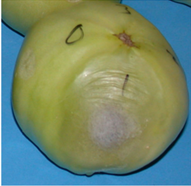
Figure 5. Rhizopus rot on green fruit.

structures (especially under humid conditions). Tissues within the lesion are usually held together by relatively coarse strands of fungal hyphae. Dark sporulation may crown the white tuft of Rhizopus . The mycelium can infect adjacent fruit through natural openings or mechanical wounds creating nests of mold and diseased fruit (Figure 6). The spores are extremely small and lightweight, and can be carried by air currents to infest new fruit, potentially far from the source. Under favorable conditions, Rhizopus has been observed to grow short distances on dry surfaces, such as pallets and cartons and it may survive for months in fruit residues left in picking containers and field bins.