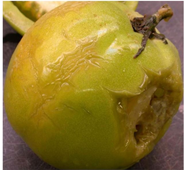
Figure 3. Watery-rot phase of sour rot on water-congested green fruit.

The sour-rot pathogen, Geotrichum candidum , is a type of yeast. Its growth on lesions on fruit resembles a thick, gelatinous mass similar in appearance to cottage cheese. The lesions themselves may initially be watery (Figure 3) but later become coated with pathogen growth (Figure 4) and remain relatively firm unless a secondary infection by a soft rot bacterium occurs. However, the odor of these lesions is similar to that produced by lactic acid bacteria, hence the disease name, sour rot.