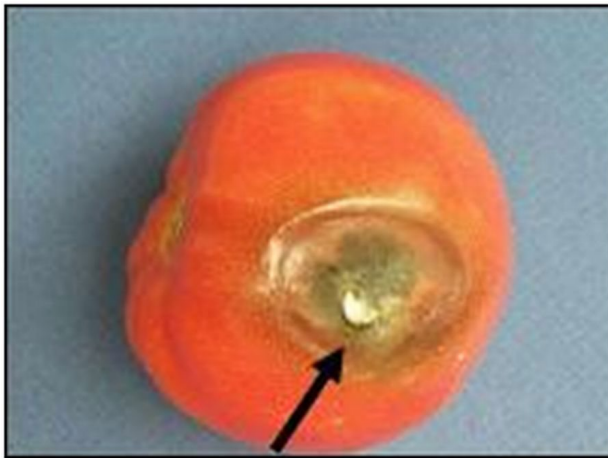
Figure 9. A fruit with a fingernail wound (arrow) that later developed into black mold rot.

Black mold rot often appears on the shoulders, by the stem scar, or on the blossom end of fruit that have been injured by chilling, calcium deficiency, sun exposure, climatic factors that cause fruit cracking (e.g., high temperatures and high rainfall), pesticide phytotoxicity or imperfectly closed blossom-end pores (catfacing), and, perhaps, harvests during cold weather. Several different pathogens may cause black mold rots including Alternaria arborescens , Stemphylium botryosum , or S. consortiale . Lesions are initially sunken or flattened areas associated with a crack or other injury that quickly become covered with a dark brown to black mold (Figure 9). Internal lesions may develop from an infected stylar pore or vascular strand connected to the stem scar (Figure 10). In particular, dry locular cavities that have lost their gel due to a severe internal bruise (Figure 11) are likely to develop internal blackspot. This disease usually does not spread from fruit to fruit in boxes. Green fruit are quite resistant unless exposed to chilling temperatures, blossom-end rot or damage by certain spray mixtures.