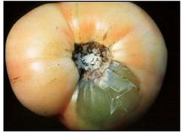
Figure 1. A typical bacteria soft rot lesion.

Certain bacteria, called the soft rot bacteria, cause a common, and potentially devastating, postharvest disease called bacterial soft rot . The pathogen liquefies fruit tissue by breaking down the pectate “glue” that holds plant cells together (Figure 1). Bacterial soft rot can be caused by at least four different bacteria.