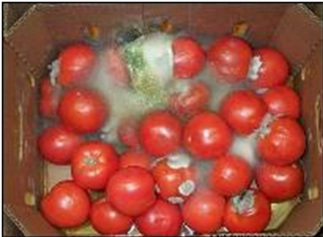
Figure 6. A carton of tomatoes with “nested” Rhizopus rot (and secondary fungi).

Phytophthora , or buckeye rot , usually causes a circular rot that looks water-soaked, later darkening in the center and/or becoming overgrown with sparse, white mycelia (Figure 7). The pathogen belongs to a group of microorganisms often referred to as “water molds,” because their infectious propagules are dispersed by water. Therefore, buckeye rot often develops on fruit growing near wet spots in a field. Initial symptoms appear as small stains in the fruit surface. On harvested fruit these stains may be overlooked by sorters. However, in stored tomatoes the small stains enlarge and the pathogen can move from diseased to adjacent healthy fruit, leading to the term “buckeye nesting” or “snowballs” (Figure 8). Buckeye rot is rare during normal production seasons, but is not uncommon during wet periods, particularly if standing water exists in fields.