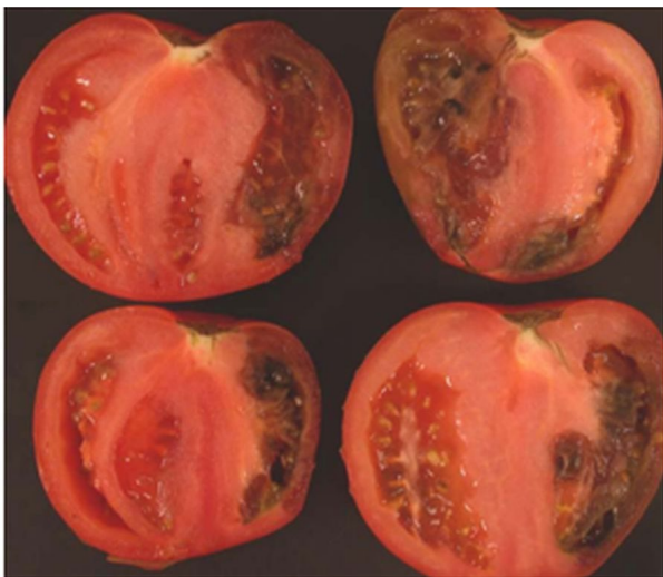
Figure 10. Internal black mold rot lesions developing in fruit harvested (as pinks) during a cold morning.