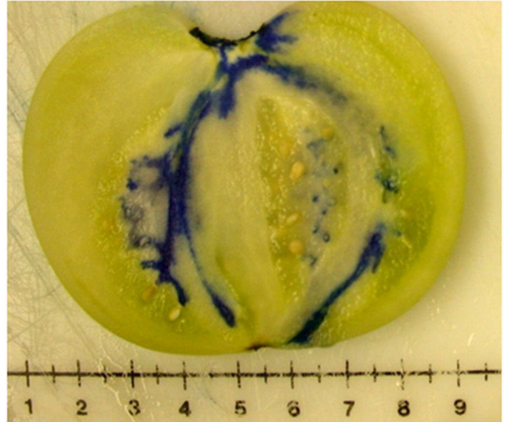
Figure 14. An extreme infiltration of the stem scar and blossom-end scar by a dye solution illustrates that microbes could be internalized under certain conditions.

presence of air bubbles in openings in the tomato surface, particularly the stem scar. For example, infiltration occurs when warm tomatoes are submerged in cool water as briefly as 5–10 minutes. As the fruit cools, air inside its tissues contracts, creating a vacuum that draws the surrounding water (and suspended microbes) into openings such as the stem scar or catface at the blossom end (Figure 14). Infiltration can also occur when fruit are struck by a high-pressure stream of water such as when tomatoes are flumed from a gondola or if there is an excessive amount of fruit in a dump tank or flume that causes some fruit to be submerged several layers deep.