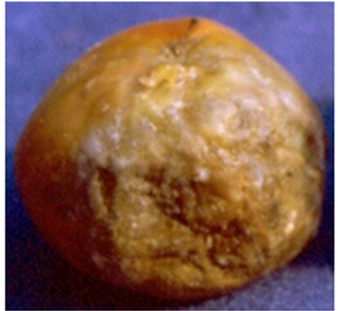
Figure 7. Advanced buckeye rot.

Phytophthora , or buckeye rot , usually causes a circular rot that looks water-soaked, later darkening in the center and/or becoming overgrown with sparse, white mycelia (Figure 7). The pathogen belongs to a group of microorganisms often referred to as “water molds,” because their infectious propagules are dispersed by water. Therefore, buckeye rot often develops on fruit growing near wet spots in a field. Initial symptoms appear as small stains in the fruit surface. On harvested fruit these stains may be overlooked by sorters. However, in stored tomatoes the small stains enlarge and the pathogen can move from diseased to adjacent healthy fruit, leading to the term “buckeye nesting” or “snowballs” (Figure 8). Buckeye rot is rare during normal production seasons, but is not uncommon during wet periods, particularly if standing water exists in fields.