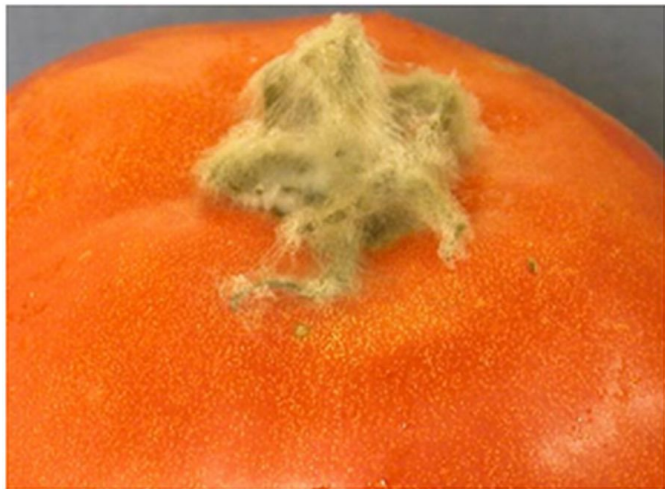
Figure 12. Storage mold covering an attached stem but without evidence of penetration into the fruit.

Storage molds can develop on fruit that have been gassed or stored for prolonged periods of time in humidified rooms. These molds grow over the stem scar, attached stem, blossom scar or other corky areas (Figure 12). They are generally non-pathogenic and do not penetrate into the flesh of the fruit. However, the mold detracts from the appearance of the fruit and may lead to shipment rejection.