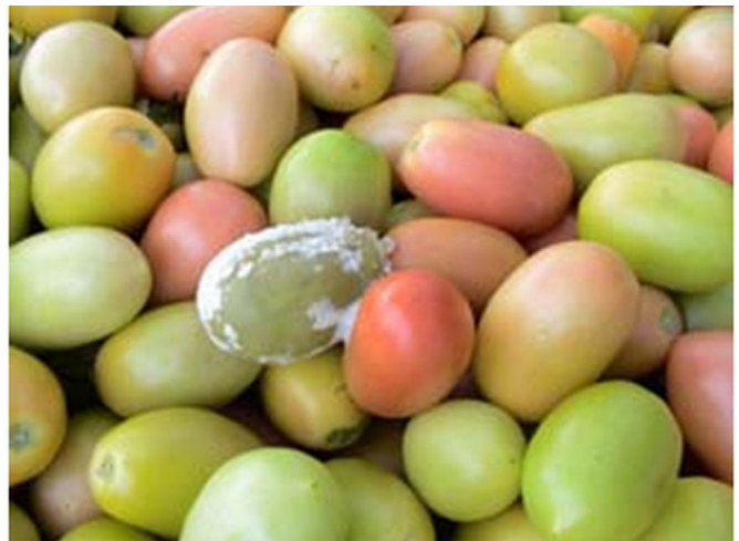
Figure 8. Water mold covering infected fruit (snowball) and spreading to adjacent fruit.