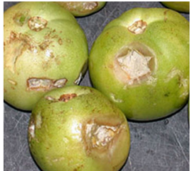
Figure 4. Sour rot lesions covered with pathogen growth.

A second common fungal pathogen is Rhizopus stolonifer , which is in the bread mold group of fungi. This pathogen grows very aggressively . On tomatoes, Rhizopus rot appears water-soaked and may exude a clear liquid (Figure 5). The lesion surface may be covered with thin, cotton-like fungal