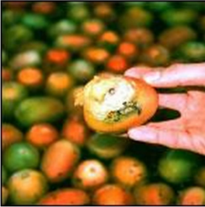
Figure 13. An infected tomato can spread inoculum to healthy tomatoes in the flume/dump tank.

may internalize in wounds or stem scars on tomatoes where they are protected from antimicrobial treatments. “Vigilance” is the key word in preventing decay. In the following section, key considerations are presented for establishing good management practices (GMPs) to maintain sanitary conditions during tomato packing and handling.