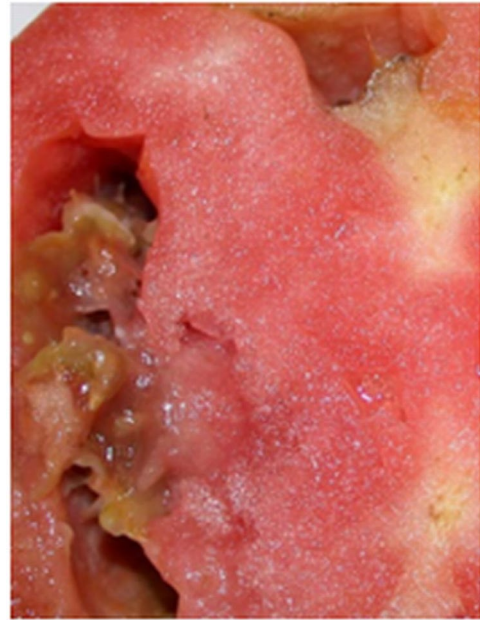
Figure 11. Dry locular cavity due to severe internal bruise.

Several other fungi can infect tomato fruit in the field and later lead to postharvest decays. However, these, like black mold rot, rarely spread among fruit within a box and can be considered minor decay problems for Florida tomatoes. However, each of these diseases can provide entry points for more aggressive decays such as bacterial soft rot, Rhizopus rot or sour rot. Fusarium rots can develop on tomatoes that are in contact with the soil and/or have been chilled in the field. The surface of the lesions is covered with fluffy white mycelium with undertones ranging from shades of pink of orange to purple. Target spot ( Corynespora cassiicola ) develops on tomatoes (plants and fruit) during long periods of high moisture and warm ambient temperatures. Fruit lesions are small, dark brown spots that enlarge and split open as the fruit ripens. If the disease becomes severe in the field, the plants will defoliate, thereby exposing the fruit to sunlight, which increases surface cracking and sun damage. Phoma rot ( Phoma destructiva ) begins at the blossom end of fruit as sunken black spots with water-soaked edges and dark-centered rings, similar in appearance to buckeye rot. Anthracnose , caused by Colletotricum spp. develops on primarily ripe to overripe fruit, usually during wet, warm conditions. Cladosporium rot , caused by Fulvia fulva , develops under highly humid conditions, usually in greenhouses.